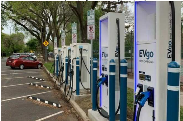
Fig. 4: The charging stations with varying speed charging Source: Governing.com [11]

Phase 3: This Phase affords the quickest possible charge at 480V direct current (DC) by fast chargers [11].