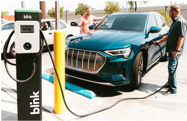
Fig. 1: Public Charging Station.

The challenge of the costs of building charging stations at strategic points in many cities of our countries is snowballing the incidence of range anxiety. But with the enactment of anticipated policy of Infrastructure Investment and Job Act, it is believed that this should be a gateway for improvement and availability of fund by the Federal government to provide many more EV charging Stations [11]. Although, there is always fear about the distance an EV can drive, which may not be enough to reach its destination. Interestingly, it was observed that the average individual journey in the UK is less than 16 km, though, in Europe, longer distances have been achieved with some varieties of EVs in recent times [5], [15]. Suffice to say that the adequate driving range of EVs and their maximum performance hinge on a suitable energy storage facility available. Over time, some of these energy storage facilities have been developed by unceasing efforts in research, ranging from batteries (i.e., storing energy using a chemical reaction) to ultracapacitors (i.e., storing energy by employing an electric field). And these batteries are charged at some designated corridors of charging stations across the country, Figure 1, when the need arises.