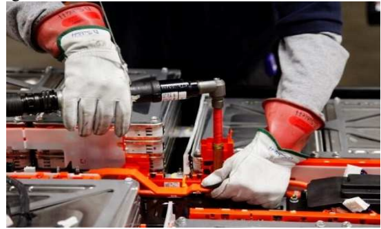
Fig. 5: Repairs on the EV damaged components.

replacing damaged or malfunctioning components is very high.