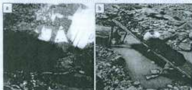
Plate 3: (a) An abandoned open pit (b) Contamination of water along the stream due to gold processing.