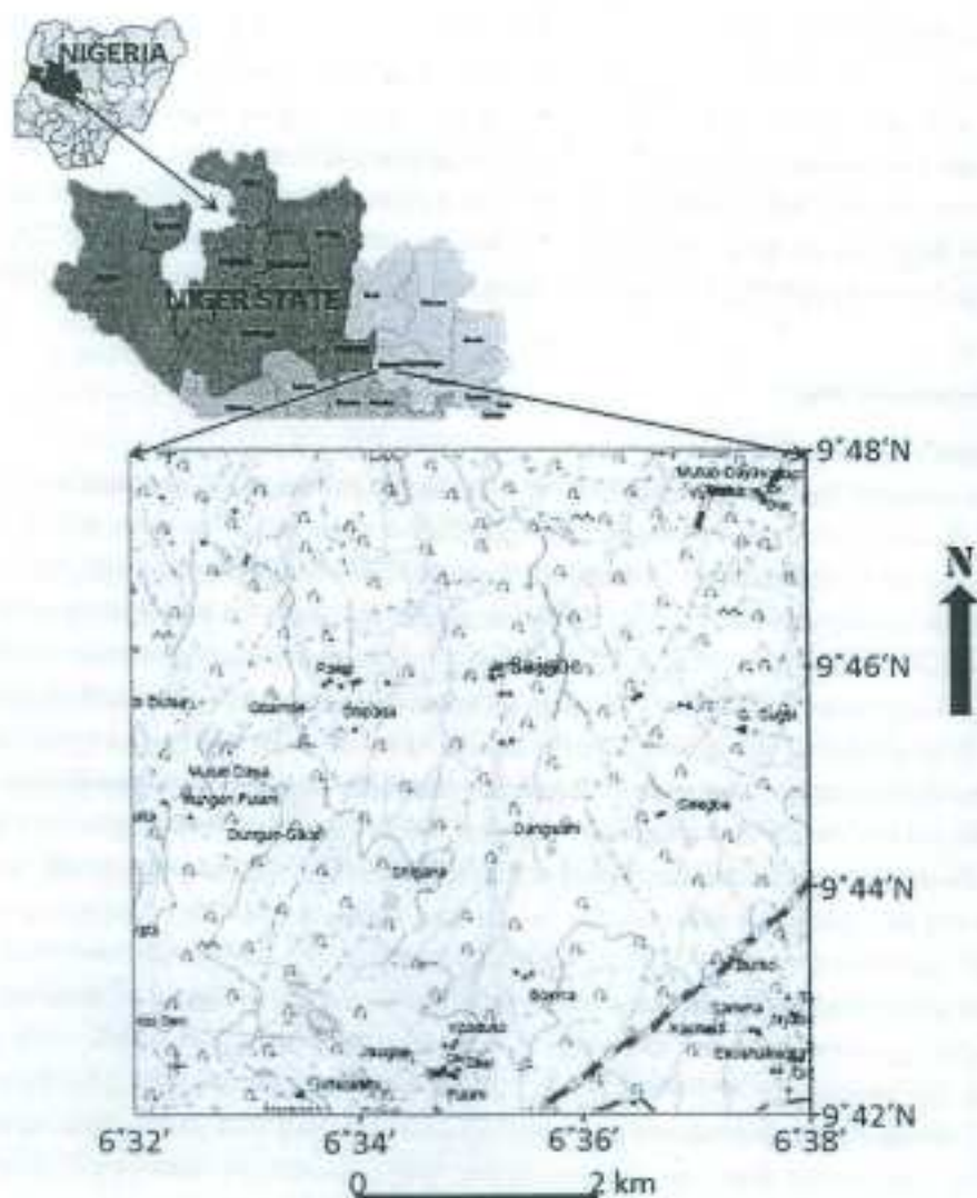
Figure 1: Location map of Saigbe and environs in Niger State, North-central Nigeria.