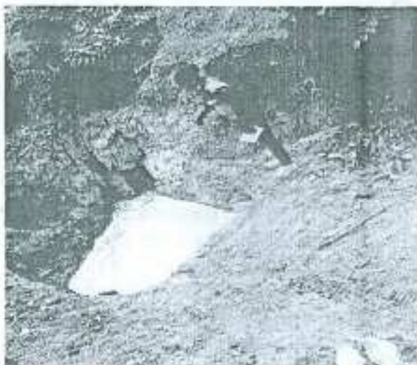
Plate II: Pool of Water Accumulation in an Open Pit Created by Mining