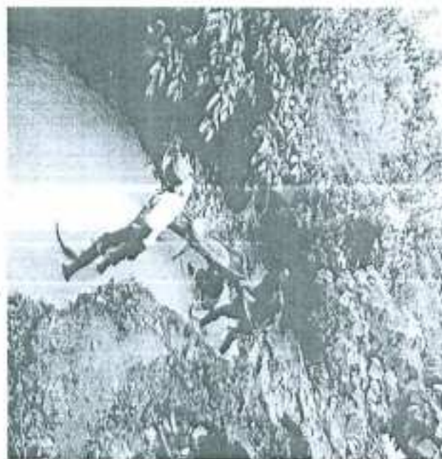
Plate IV: Human use and Consumption of Water Polluted with Trace Elements

The mining activities in the area have led to the generation of diseases due to pollutants, accidents at mines and consumption of polluted water (Plate IV). The effects of some of these pollutants manifest themselves immediately (cyanide, for example) but others (such as