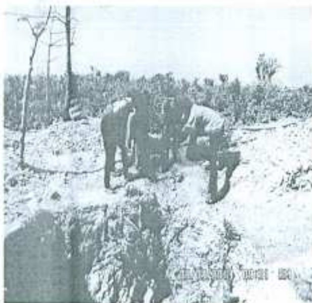
Plate III: Production of Noise and Dust from Machineries at the Mining Site

The production of noise and vibration occur during mining operation through the use of mobile equipment, vibration from the vibrator and air blast. Noise and vibration lead to cracks in building, discomfort, damage of the auditory system, frightening of animals and relocation of man. Similarly, it was reported by Aigbedion, (2005) that air pollution occurred around Sagamu and Ewekoro cement works in Ogun as a result of dust which leads to eye pain and asthmatic attack.