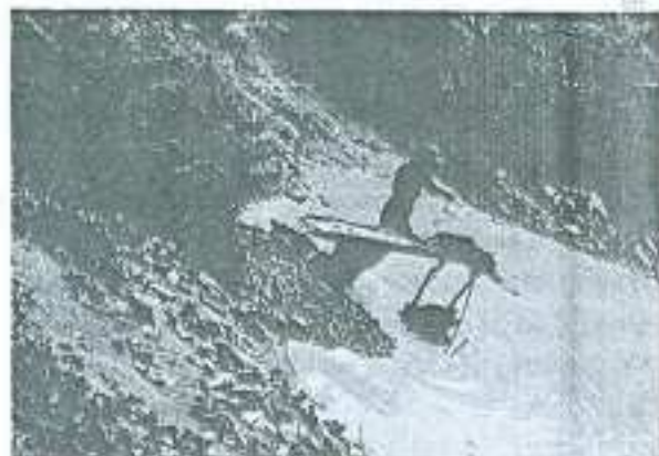
Plate I: Pollution of Water Bodies due to Panning and Deposition of Mine Tailings

The use of chemicals such as mercury and cyanide during ore processing also constitute the major pollutants of surface and ground water. Improper storage and mishandling of this chemical can also lead to water pollution. The presence of these chemicals can endanger the lives of both aquatic animals and humans.