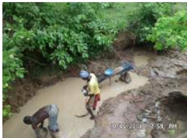
Figure 10. Brown coloured water discharged into nearby stream which renders the water unfit for human consumption

Disturbed areas, mine waste and rock dumps increase the total solid load of water bodies which affect the quality of water in the study area. The water turns brown due to panning of gold which is discharged into nearby streams (Figure 10). Water contaminated as a result of the gold mining may pose human health and environmental risk.