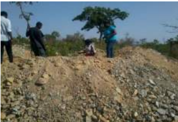
Figure 6. Overburden and rock wastes removed from the mine resulting in different soil texture and structure from the original soil before the beginning of mining.

Ogezi (2005), reported that on Jos Plateau where tin and columbite mining took place has resulted in the destruction of landscape and left behind over a thousand water ponds, lakes, alluvial heaps and widespread erosion. Humans and animals get drowned in such abandoned mine ponds. Similarly, Salati et al. (2011) reported that devastation of over 1000 hectares of suitable farmlands and flooding of abandoned pits have become death traps due to artisanal mining of Azara barytes deposits in Nasarawa state.