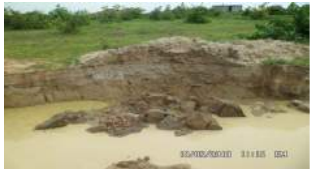
Figure 3. Photograph showing how natural landscape has been destroyed due to mining in Luku

The heaps of rock wastes and tailings generated as a result of the mining activity cannot be easily disposed off and this also leads to the destruction of the natural landscape (Figure 4).