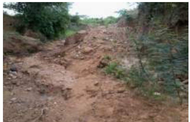
Figure 8. Photograph showing high Sedimentation on the stream channel due to erosion. This reduces the depth and with of the stream which may cause serious flooding during the period of heavy rains