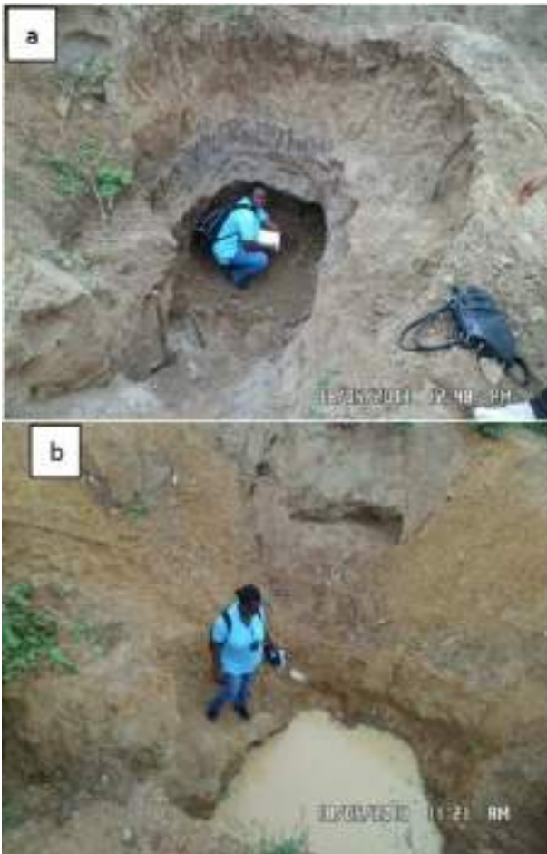
Figure 5. Photograph showing mine pit not filled with water (a) and that not filled with Water (b) in Luku.

Ogezi (2005), reported that on Jos Plateau where tin and columbite mining took place has resulted in the destruction of landscape and left behind over a thousand water ponds, lakes, alluvial heaps and widespread erosion. Humans and animals get drowned in such abandoned mine ponds. Similarly, Salati et al. (2011) reported that devastation of over 1000 hectares of suitable farmlands and flooding of abandoned pits have become death traps due to artisanal mining of Azara barytes deposits in Nasarawa state.