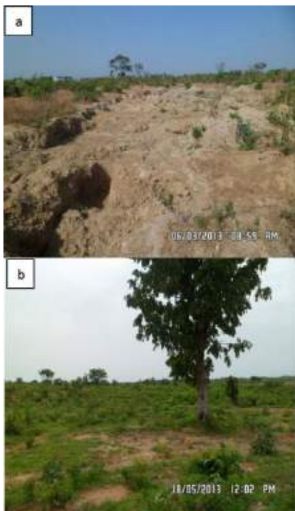
Figure 9. Photograph showing the effect of loss of vegetation on land (a) as compared to an adjacent area that was not affected by the mining activities (b)

The clearing of the site for mining activities has resulted in deforestation. Large amount of vegetation has been destroyed and this exposes the soil to erosion and renders it unfit for crop production (Figure 9a). The degree of deforestation can be evaluated if compared to the adjacent area which was not affected by the mining activities (Figure 9b).