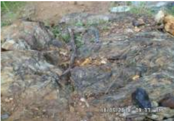
Figure 2. Schist outcrop in the study area showing schistosity

The granites cover about 20% of the study area. They intruded the schist and are light in colour. Texturally, they are coarse grained. Mineral constituent of the rock consist of quartz, feldspar and muscovite. The granites have not been affected by weathering and are highly jointed.