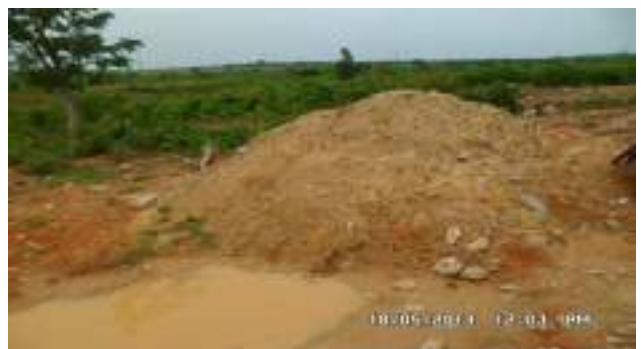
Figure 4. Heaps of rock wastes and tailings generated as a result of the mining activities

Large pits were also created as a result of the mining activity. Some of the pits are not filled with water while other are filled with water (Figure 5 a and b). These pits can be dead traps to both man and animals. It could also become dangerous habitat for reptiles such as snakes which can cause harm to man.