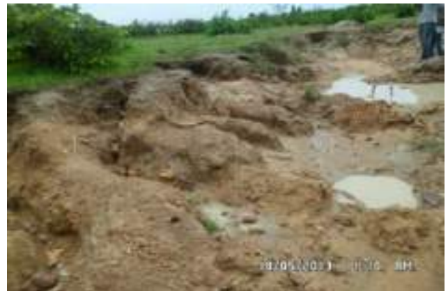
Figure 7. Photograph showing a new stream channel being formed as a result disrupting of the old channel by erosion.

The major effect of mining activity in the study area is soil erosion and sedimentation. Erosion and sedimentation are caused by land disturbances and removal of vegetation in the process of mining. Erosion from overburden and tailing piles often increase sediment loading in a nearby stream, thereby modifying the stream morphology by disrupting a channel, diverting stream flow and changing the slope or bank stability of the stream (Figure 7). High sediment concentration decreases the depth of stream resulting in greater risk of flooding during times of high stream flow (Figure 8).