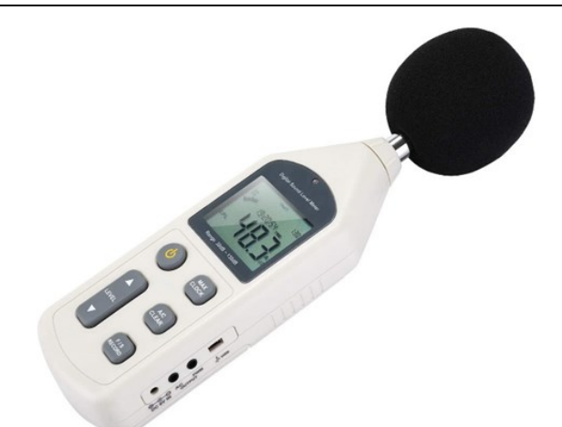
Plate II: Digital Sound Level Meter