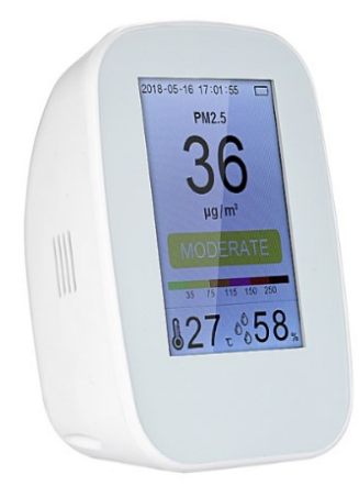
Plate I: Multifunctional Air Quality Detector