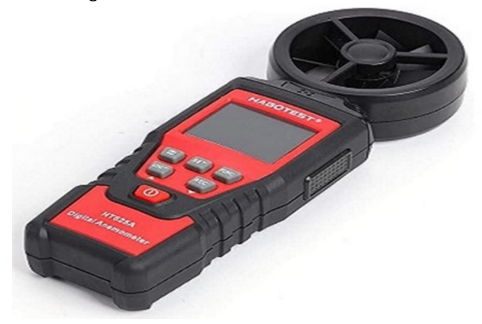
Plate IV: HABOTEST HT625A Digital Anemometer