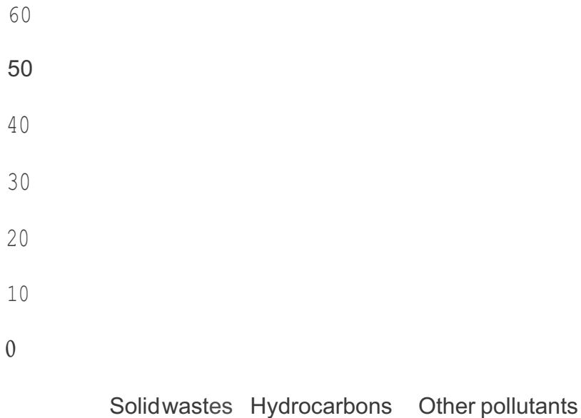
Figure 4.1: The Common Land Pollutants.

The histogram in fig. 4.1 shows that solid wastes contribute the greatest land pollutants in the study area. 50 out of the 72 respondents agreed that solid wastes are the greatest land pollutant in the study area while only 15 respondents attributed land pollution to hydrocarbons. 5 out of the respondents believed that other pollutants other than solid wastes and hydrocarbons are the causes of land pollutants in the study area. Solid wastes could have been the greatest land pollutants in the area due to population of people and inappropriate disposal of such wastes in the study area.