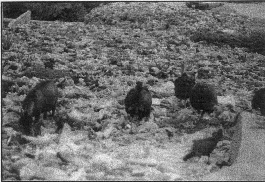
Plate 1: Refuse dump in Katuma in Suleja