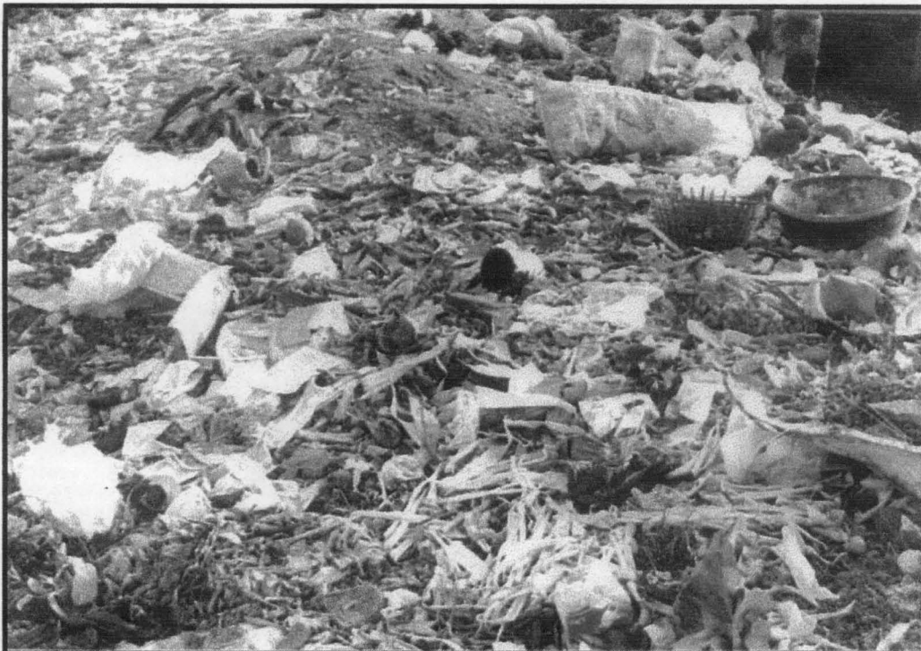
Plate II: Refuse dump in Suleja. Note the various/different types of material.