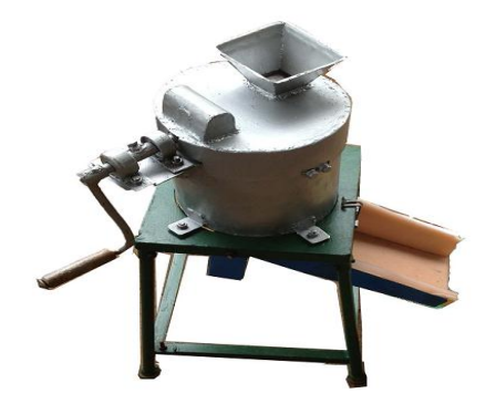
Figure 2: Roasted groundnut seeds peeling machine