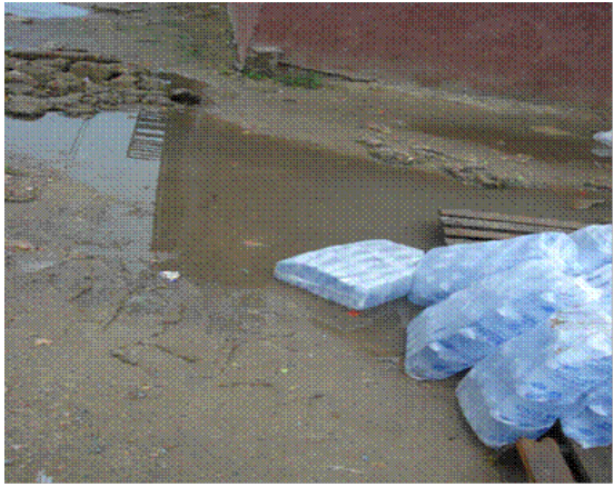
Plate I: Improper storage condition of water in sachet.

The health risks associated with methods of hawking of sachet water in the streets of Lagos was also investigated. The investigators sampled 8 bands of sachet water from different receptacles; open packs from factory, buckets and wheel barrow containing ice-blocks and refrigerators. Bacterial cultures were set up for the sample-water contained in sachet, surface of the sachet, swabs from compartments of the refrigerators and waste water of defrosted ice in the bucket and wheel barrow. This study revealed that enteric pathogens and E. coli were not isolated from any samples and brand of sachet water, but significant part of the isolates on the samples were collected from cooling receptacles. Vendors and their patrons have mostly contributed to the overall contamination of hawked sachet water. (Plate I)