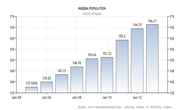
Fig. 1. Nigeria population growth rate since 2004. Source reference [7].

African countries, uncontrolled landfills, open dumpsites and open burning (Fig. 3) are still the key waste management practices, where scavengers pick a few valuable materials and recycle them [9].