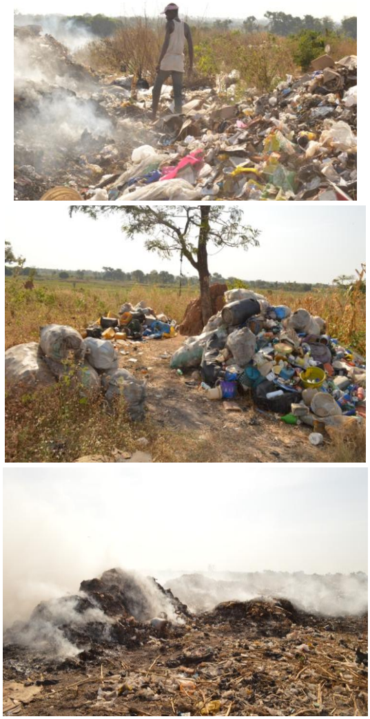
Fig. 3. Typical municipal waste dumpsite, located in Minna, the capital city of Niger State, Nigeria; showing the activity of a scavenger and a pile of scavenged materials. (Photos taken in December 2013).

Landfills are basically physical facilities being used to dispose residual solid waste, in the surface soils of the earth [8]. Many countries of the world uses landfill as the largest route of municipal solid waste disposal including the UK, Portugal, Italy, Spain, Finland and many others [3]. In most